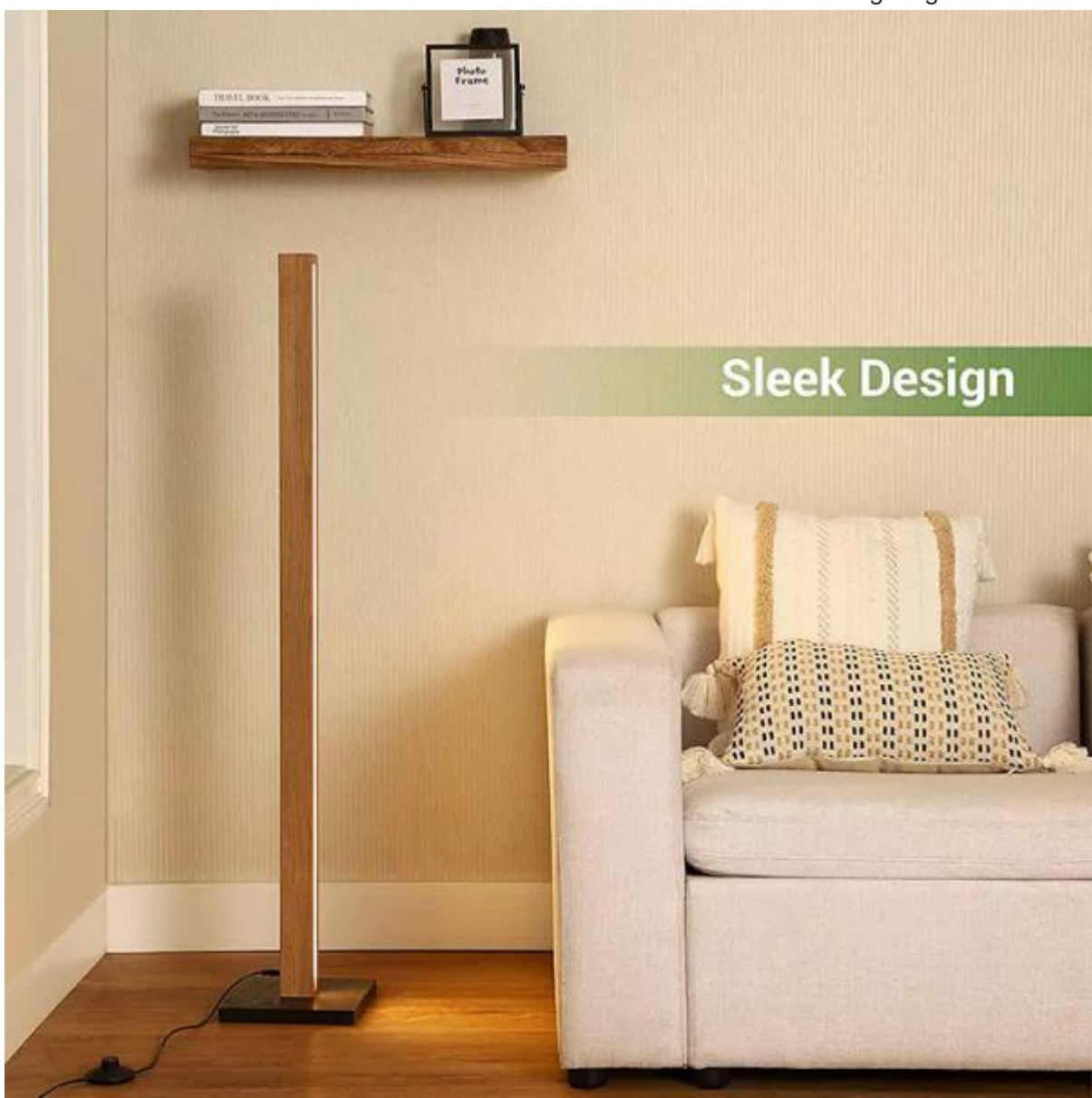
Natural wind all-wood product design, with thick solid wood at the bottom to balance the lamp body

ADDRESS:2nd Road, Jinqianling Industrial Zone, Jitigang, Huangjiang Town, Dongguan City, China. TEL: \underline{+86-769-82607368} / \underline{+86-18928200163}