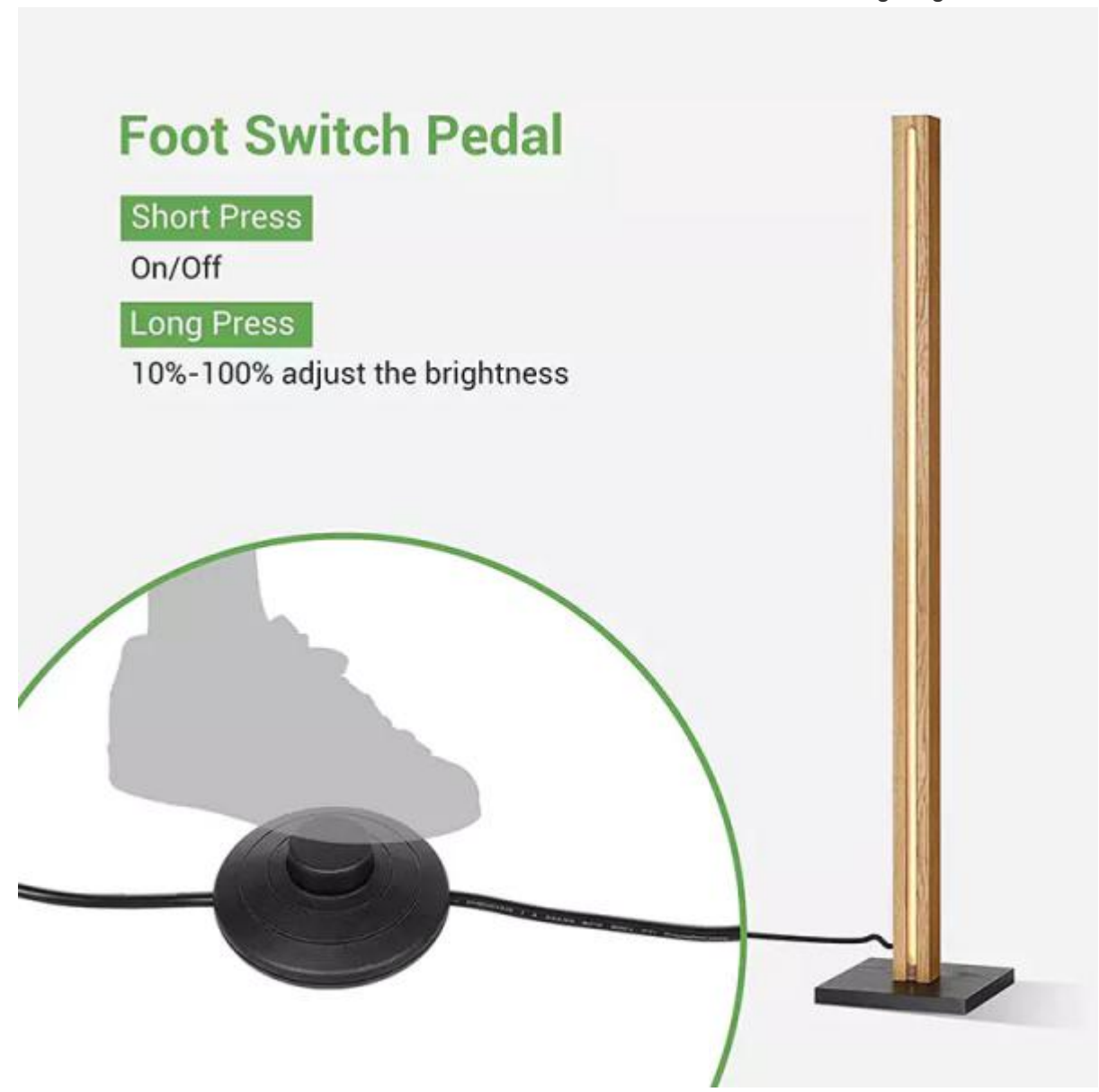
The led lamp is controlled and dimmer on the foot

ADDRESS:2nd Road, Jinqianling Industrial Zone, Jitigang, Huangjiang Town, Dongguan City, China. TEL: +86-769-82607368/+86-18928200163